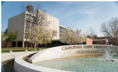
The Campus site of CSUN in California

The group will visit local companies and have lectures with Executives, having the opportunity of interacting with business reality of the United States. Visits to organizations and events will be suggested to the students during their spare time.