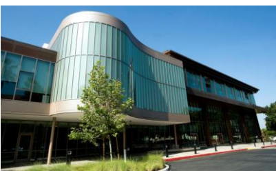
The Campus site of ULV in California

The University of La Verne is one of the most traditional and respected American universities. Founded in 1891, ULV is a private nonprofit institution, with its main campus in the city of La Verne, California, 40 minutes from Los Angeles.